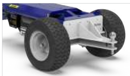
BALL/PIN HITCH Ø20-25