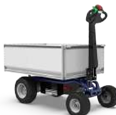
PLATFORM 720 x 1325 x h385 mm 890 x 1325 x h385 mm