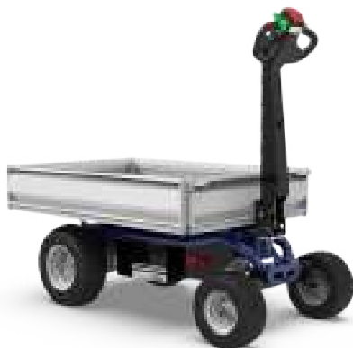
PLATFORM 720 x 1325 x h185 mm 890 x 1325 x h185 mm

JESPI has a wide range of different sized loading platforms to fulfill every transport need. All standard platforms have 3 removable sides to make easier the loading of materials. Moreover, it's possible to equip JESPI with any kind of customized machinery or equipment. It can be equipped with hooks for towing trolleys up to 3.000 kg .